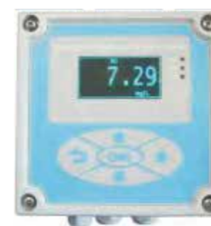
GDC-01/02 Terminal Single or Dual-Channel