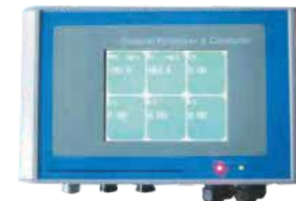
GDC-04/06/08 Terminal Multi-channel up to 8