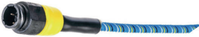
FG-ECX Sense Cable Male Connector Tip