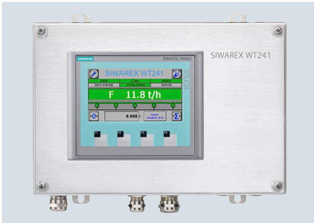
SIWAREX WT241 weighing terminal

The SIWAREX WT241 is a weighing terminal for belt scales. Siemens standard components are installed in a stainless steel enclosure with numerous connection options. This ensures the tried and tested SIWAREX quality as standalone solution and is ideal for belt scales.